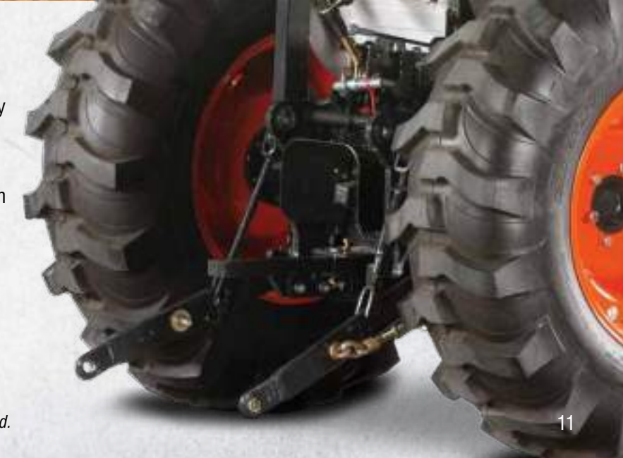
Image shows optional backhoe sub frame installed.

You can easily raise and lower the 3-point hitch lift arms using the height control lever, located behind the machine.