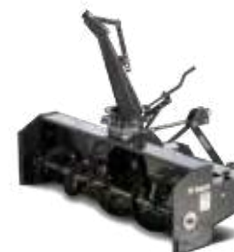
3 pt. snowblower