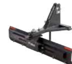
3 pt. angle blade