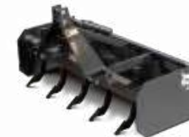
3 pt. box blade