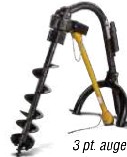
3 pt. auger

There are more than 550 dealer locations in North America, so you're never far from an expert source of implements, attachments, accessories, parts and service.