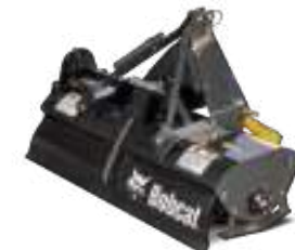
3 pt. tiller