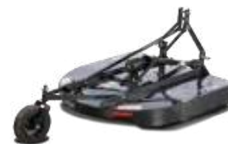
3 pt. rotary cutter