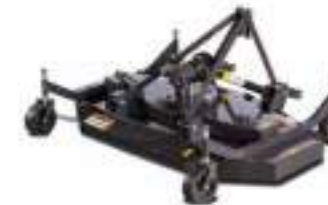
3 pt. finish mower